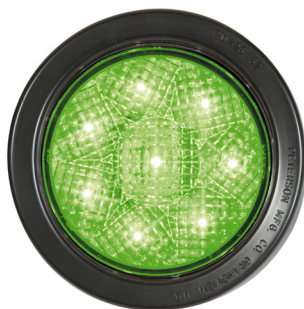
PM-1217G-R-426 flush mount