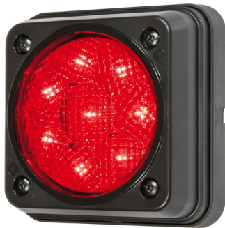
PM-1217G-R-417 surface mount